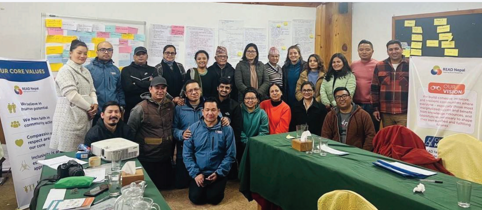
READ Nepal Team

These mothers are a living testament to the program's ripple effect: when girls rise, they lift their families and communities with them. Their journey proves that it's never too late to learn—and that empowered daughters can inspire empowered mothers.