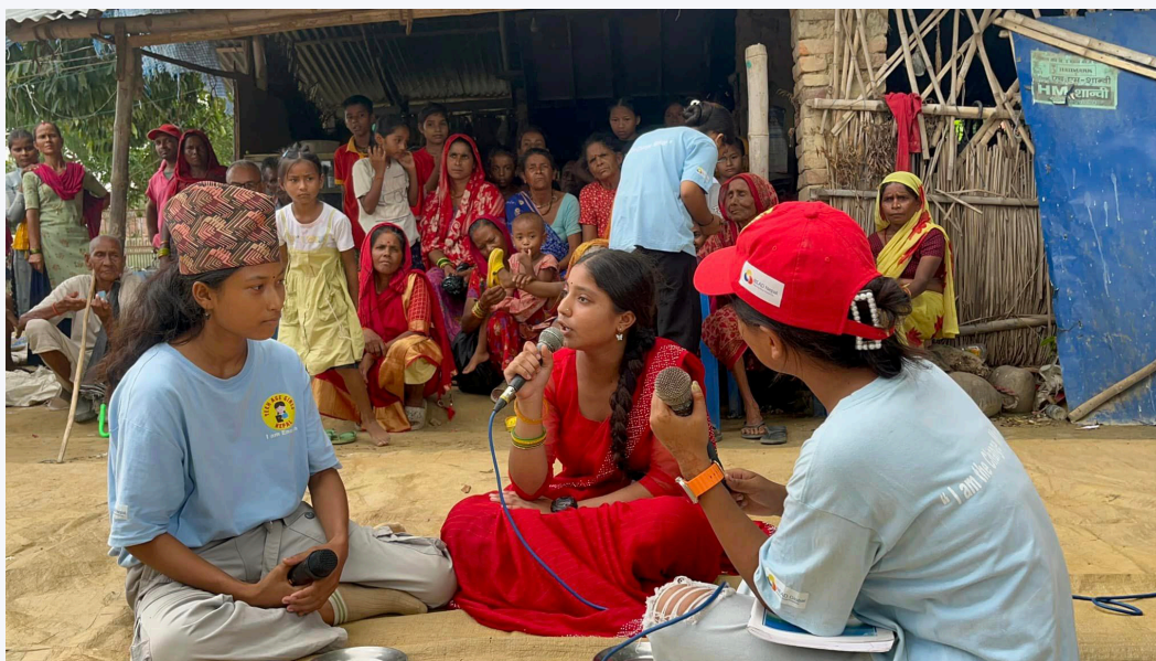
Tech Age Girls used street dramas, trainings, and peer mentoring to reach more than 14,000 of their peers on issues such as child marriage and climate action

In 2024, with support from the Stone Family Foundation, READ centers trained 386 adolescent girls across six Centers in five districts, equipping them with 21st-century skills in digital literacy, leadership, and climate awareness and building their agency to set and pursue ambitious goals.